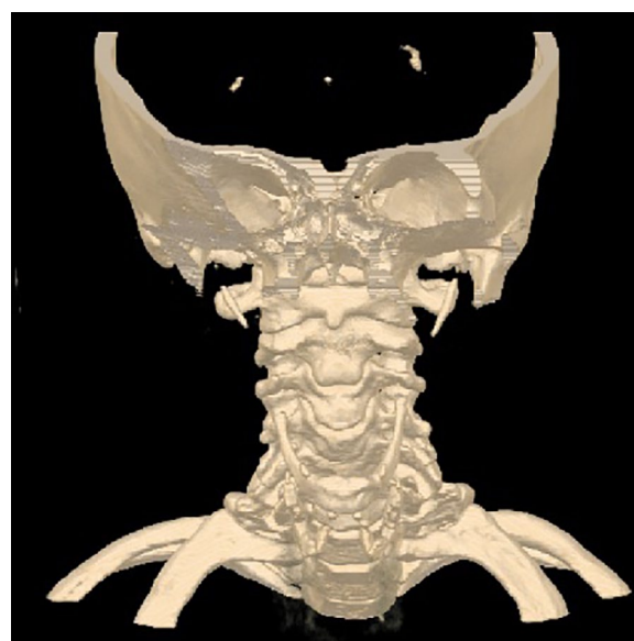
Figure 1. Three-dimensional reconstruction of computed tomography images. A transverse view showed the elongated left styloid process.

Patients wrote an informed consent form for publication of data.