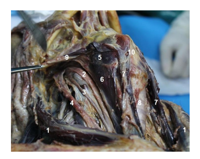
Figure 3 - This figure shows the lateral region of the neck. 1. Sternocleidomastoid muscle; 2. Common carotid; 3. Vagus nerve; 4. Internal jugular vein; 5. Thyrohyoid muscle; 6. Sternothyroid muscle; 7. Sternohyoid muscle; 8. Cervical trachea; 9. Omohyoid muscle; 10. Thyroid cartilage.

Lateral to the visceral compartment the carotid sheath that envelops the vascular-nervous bundle was identified. It contained the common carotid artery, medially, the internal jugular vein laterally, the vagus nerve posteriorly. The components of this vascular-nervous bundle were isolated and carefully cleaned thoroughly by using blunt dissection (Figure 3).