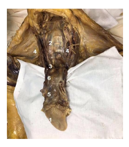
Figure 4 - This figure shows the tongue and the retro-esophageal space. 1. Tongue; 2. Vertebral bodies; 3. Retro-esophageal space; 4. Neurovascular bundle; 5. Pharynx; 6. Esophagus

Posterior to these structures it is possible the retro pharyngeal space was identified which continues, inferiorly, with the retro retro-esophageal space. This space is important from the clinical point of view, since oral infections, can track down to the retro pharyngeal and retro esophageal space and then to the mediastinum, causing mediastinites. To access the retro pharyngeal space, the tongue was reflected by incising the floor of the oral cavity on the lower margin of the mandible body using scalpels and forceps. This allowed to expose the prevertebral fascia that contains the cervical vertebrae (Figure 5).