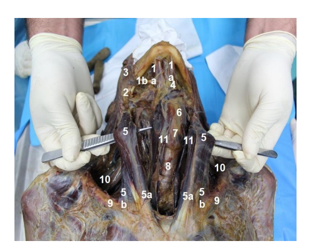
Figure 2 - This figure shows the sternocleidomastoid muscle and the anterior region of the neck. 1. a.anterior belly of the digastric muscle; 1b. posterior belly of the digastric muscle; 2. Mastoid process; 3. Masseter muscle; 4. hyoid bone; 5. Sternocleidomastoid muscle; 5a. sternal head of sternocleidomastoid muscle; 5b. clavicular head of sternocleidomastoid muscle; 6. Thyroid cartilage; 7. Cricoid cartilage; 8. trachea; 9. clavicle; 10. scalene muscles; 11. Sternohyoid muscle

The latter is located at the C4 level and provides attachment for both supra and infra-hyoid muscles (Figure 2).