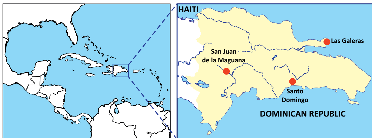
FIG. 1.—Geographic localization of the three sampling places in the Dominican Republic.

analysis of the Dominican Y chromosome variability is of crucial importance to fully understand the effect of the European colonization and the trans-Atlantic slave trade on the genetic diversity of the Antilles, considering the important role of Hispaniola in the colonial Caribbeans and its peculiar history.