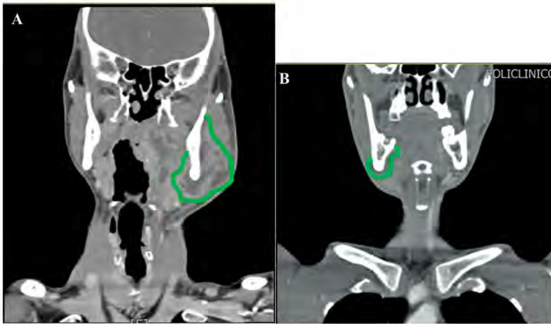
Figure 1. CT scan of coronal sections (A,B). The green line delimits the abscess’s area, showing the crossing of the inferior-medial side of the mandibula.

The MIIA technique has been used on 16 patients (26.2%) in all, carrying out dental extraction and subsequent drainage of the submandibular lodge without a cervicotomy. Examining the CT scan results, the abscess–infected area had still not crossed the inferior medial side of the mandibula or the vertical plane passing through the posterior side of the lesser horn of the hyoid bone (Figure 2).