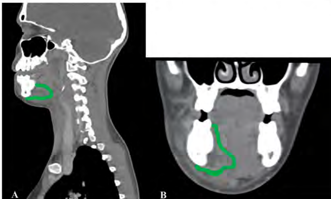
Figure 2. CT scan of sagittal (A) and coronal (B) sections. The green line delimits the abscess’s area that does not cross the inferior-medial side of the mandibula.

The MIIA technique has been used on 16 patients (26.2%) in all, carrying out dental extraction and subsequent drainage of the submandibular lodge without a cervicotomy. Examining the CT scan results, the abscess–infected area had still not crossed the inferior medial side of the mandibula or the vertical plane passing through the posterior side of the lesser horn of the hyoid bone (Figure 2).