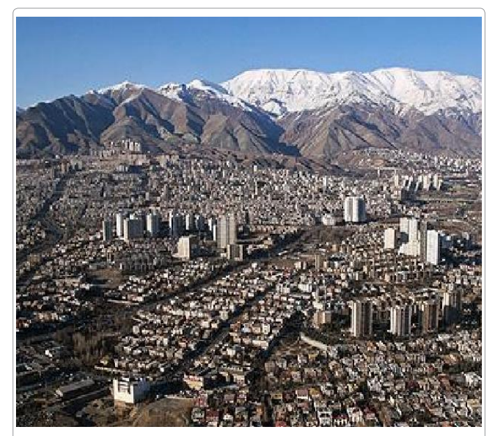
Figure 1: This image shows a view of Tehran in a clear sunny day.

The SCATS Philosophy is based on real-time enhancement by using many distributed computers as processors. Although it has libraries of offsets, phase split plans, no comprehensive, reliable plan can be defined. Instead, different plans should be checked and selected for the application to advanced cycles. SCATS is not model-based. It relies on incremental feedbacks. Intersections can be grouped as