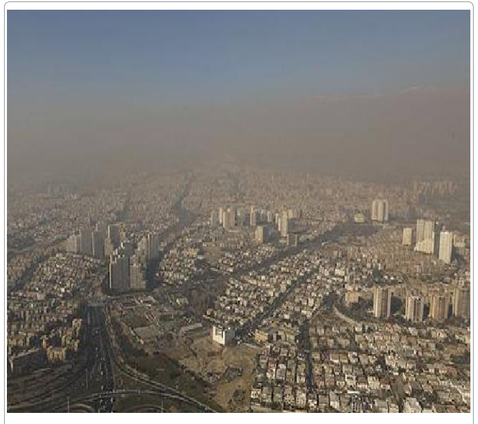
Figure 2: This image shows air pollution in Tehran from the same point of view.