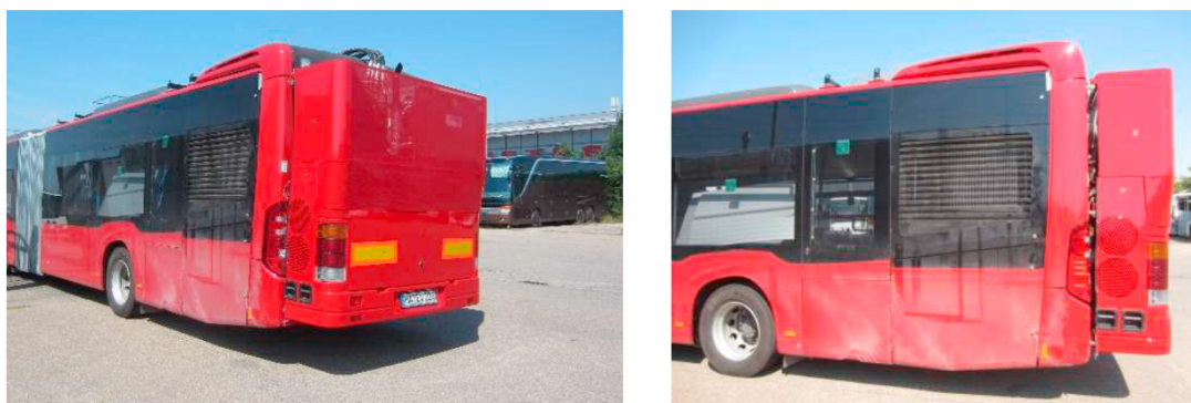
Figure 4 – Stuttgart demonstration: the test bus

Within the Stuttgart demonstration, an innovative HVAC system for electric driven city buses was deployed and tested. Aim of this demo was to show a reduction in the energy used for HVAC in the amount of 30 % compared to a conventional belt-driven HVAC system (in average, on yearly basis). The test vehicle (Figure 4) is a conventional diesel bus modified to simulate an electric bus with an adaptable high voltage battery. The conventional HVAC system was replaced by an almost completely new HVAC system designed for an electric bus, including for example an electric driven, hermetic refrigerant compressor as well as an on-roof heat pump system. The heating system and diesel engine were completely separated and a high voltage system was implemented. Instead of a high voltage battery, a power set was installed in the rear of the bus within a modified ski case. For cooling of the diesel engine as well as the generator of the power set, a separate on roof cooling unit was implemented.