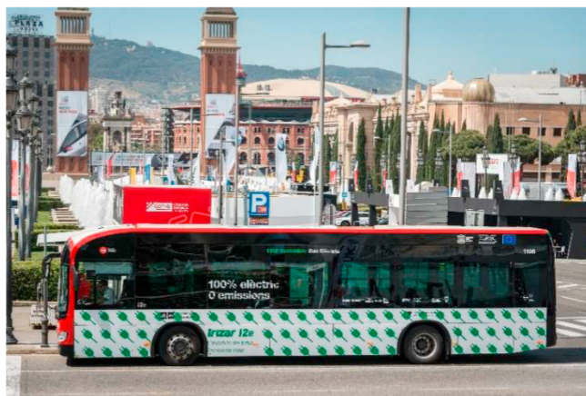
Figure 2 – Barcelona demonstration: the test bus.

Barcelona is one of the bus networks selected for testing and validating technological solutions for increased efficiency of fully electric buses. Two 12-metre electric buses were already operating within the TMB fleet as part of the ZeEUS project (Figure 2). The results achieved within ZeEUS have paved the way for more efficient operations to be achieved in EBSF_2 thanks to a multitasking demonstrator that deployed two technological innovations: an energy predictive system, to reduce the energy consumptions of the on-board auxiliaries, and solutions to increase the efficiency of climate system and thermal management, including the reduction of maintenance and service costs of the A/C unit.