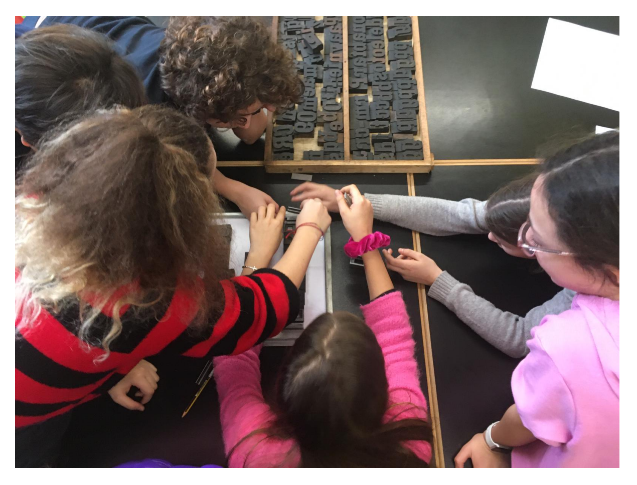
Figure 1. Letterpress Workshop at National Central Library in Rome.

The Typeful Thinking workshop is based on the sequence of five stages (Fig. 2) able to stimulate in a creative and experiential way the critical and conscious reflection on the food issue starting from the statement that morphological attributes of the letters, like the roundness/angularity of the type shapes represents a key element in the crossmodal matching of tastes with shapes (Velasco, Woods, Deroy, & Spence 2015).