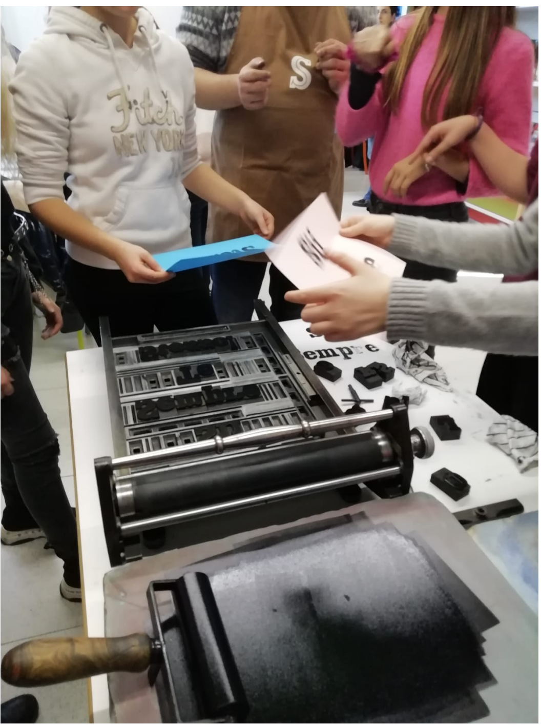
Figure 4. Example of printing during a Letterpress Workshop at National Central Library in Rome.

The greater detachment from Artful Thinking takes place at this stage through the materialisation of thoughts. The group of children will then be asked to compose the chosen adjective with the identified types and proceed with the printing process (Fig. 4). The final output will be the printed version of the chosen adjective composed with the letterpress technique. This stage plays a very important role in terms of pedagogical impact, as participants have the opportunity to follow step by step the process of conceptualisation, design and materialisation of their thinking. This possibility is offered by the letterpress printing, which by its nature allows a total control of the design phase (Caccamo, Vendetti 2019).