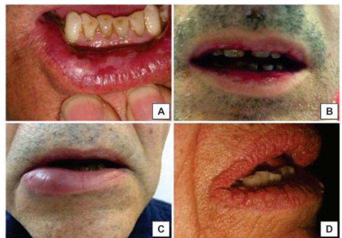
Figure 3 | Cheilitis types connected to dermatoses and systemic diseases (A = lichen planus; B = pemphigus; C = angioedema; D = acanthosis nigricans).

It is necessary to be aware that inflammatory lesions on the lip may occur with many dermatological or systemic diseases. Thus, practitioners may want to consider and check for diseases such as LE, lichen planus, Sjögren syndrome, pemphigus and pemphigoid, and angioedema (Fig. 3). In addition, cutaneous or systemic diseases sometimes begin on oral mucosa involving the lips, and so an adequate examination of all parts of the oral mucosa and skin is necessary for appropriate management.