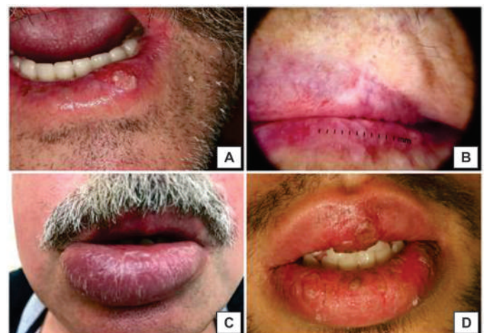
Figure 2 | Mainly irreversible types of cheilitis (A = actinic cheilitis; B = dermoscopic finding of actinic cheilitis; C = granulomatous cheilitis; D = glandular cheilitis).

This is a group of four chronic cheilitis types for which diagnoses are usually based on a biopsy and histology (Fig. 2) (1).