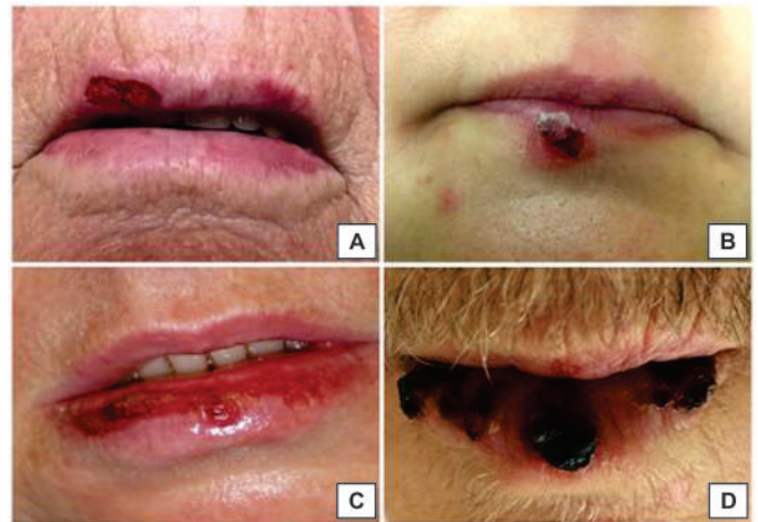
Figure 1 | Mainly reversible types of cheilitis (A = cheilitis simplex; B = infective (herpetic) cheilitis; C = contact/eczematous cheilitis; D = drug-related cheilitis).

Angular/infective cheilitis usually appears in the corners of the lips, commonly as a two-sided inflammation with erythema, deep fissures, or laceration of the labial commissure, possibly with shallow ulcers or crusts (16–18). There are numerous related and