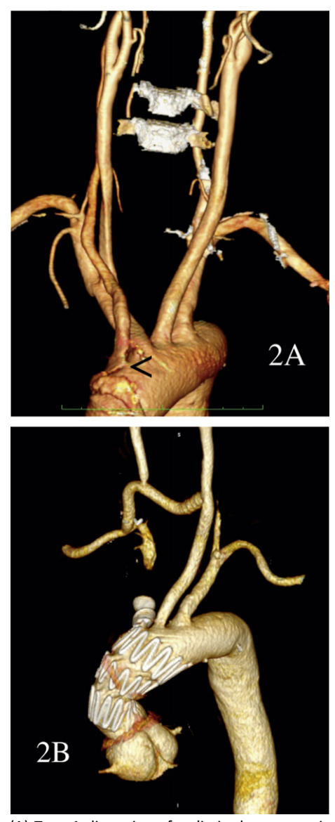
Figure 2. (A) Type A dissection after limited open repair estended to brachio-cephalic trunk and right common carotid artery: 3D VR reconstruction. (B) TEVAR in the ascending aorta + reversed LCC-RCC-RSA bypass. Plug into the brachio-cephalic trunk: 3D VR reconstruction.

we adopted a maximum oversizing of 10%. A complete TEE should be performed in all cases to assess cardiac and aortic valve function, in combination with an angiography to confirm the patency of the supra-aortic branches and coronary arteries.