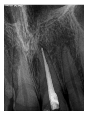
Figure 4. Postoperative X-ray.

the access cavity after each operation (26-28). The procedure was repeated tree times.