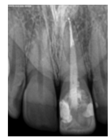
Figure 6. Periapical X-ray postoperative.

On the basis of the results, it can be concluded that in anterior aesthetic problems it's important to understand the etiology of the discoloration: in the case presented the corrosive products of the broken instru-