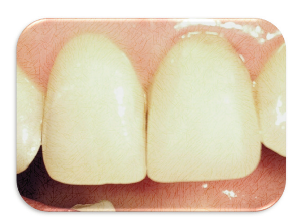
Figure 8. Follow up after 1 year.