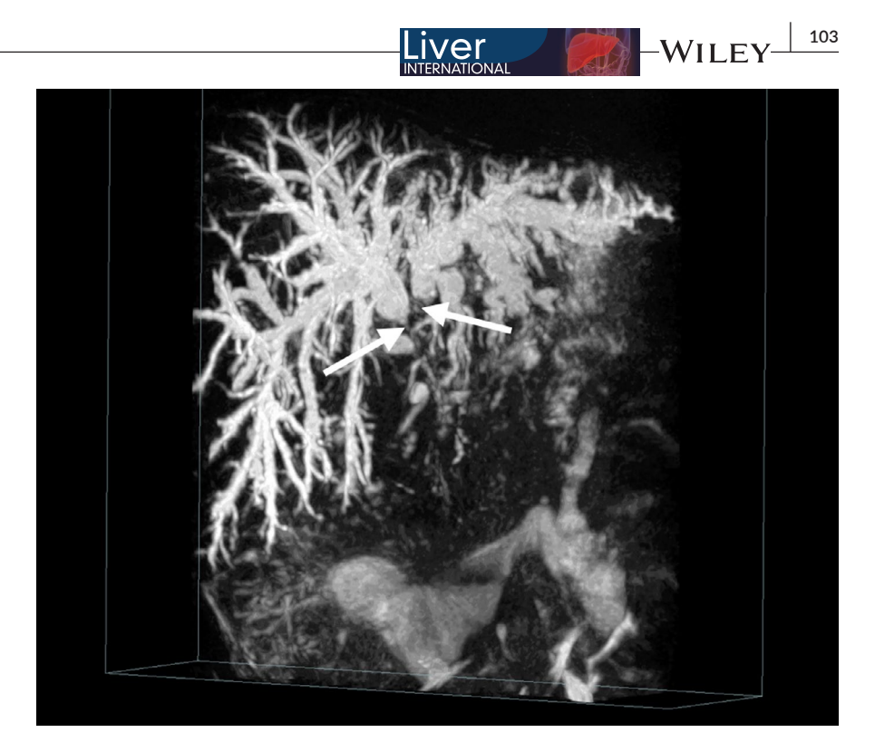
FIGURE 4 Role of MRI in eCCA. The image shows a 3D-cholangio MRI of an eCCA. In particular the white arrows indicate the absence of the signal in the right and left common bile ducts, because of the presence of a perihilar CCA, which determine the upstream dilatation of the whole intrahepatic biliary tree

the tumour with contrast material (Figure 3).<sup>28</sup> Pooling of contrast on delayed images is indicative of fibrosis and may be suggestive of an iCCA in the appropriate clinical setting. When gadoxetic acid is used, the washout should be interpreted in the portal phase instead of in delayed phases to prevent the misclassification between HCC and iCCA in a cirrhotic liver.<sup>35</sup> The non-morphological imaging obtained with MRI (radiomics features; apparent diffusion coefficient, ADC; intravoxel incoherent motion, IVIM) showed high accuracy to evaluate patients' prognosis since it can predict recurrences<sup>36</sup> and microvascular infiltration.<sup>37</sup> MRI is as accurate as CT to estimate resectability of pCCA (sensitivity 94%) since it can evaluate portal vein (sensitivity 79%) and bile ducts (accuracy 71%) involvement <sup>32,33</sup> (Figure 4).