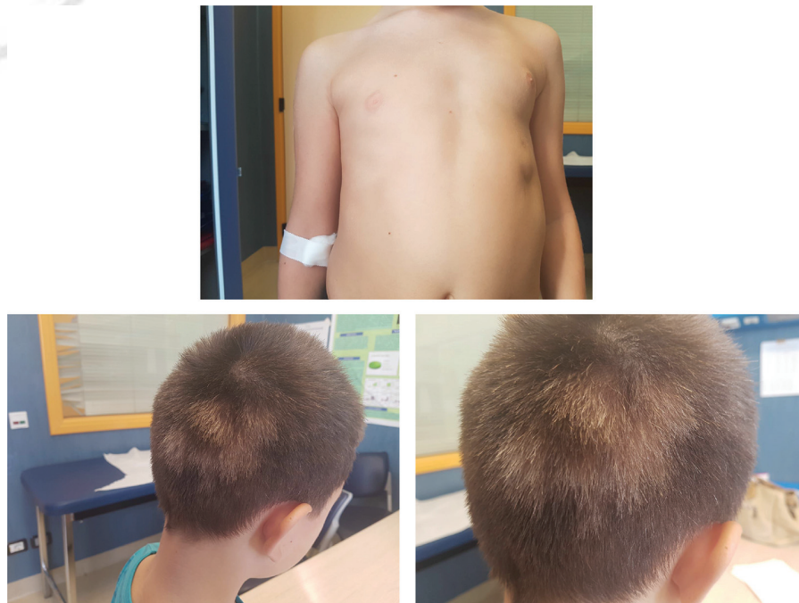
Fig. 1 Our proband's main features of double hair whorl, poliosis circumscripta/segmented heterochromia of hair, convergent squint of the right eye, and hypoplastic left pectoral region.

The child here reported exhibited in association with some typical features of PS, a complex set of scalp hair, ocular,