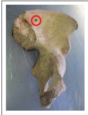
Fig. 1: Left hip bone: about 2 cm below the iliac crest on the left ilium, a wound/lesion with a diameter of 2 cm.

and whitish area. The section was then decalcified and the slides were prepared with hematoxylin and eosin staining.