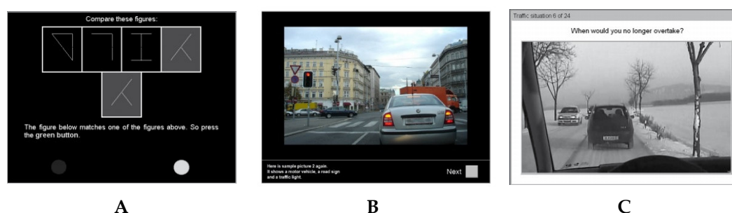
Figure 1. Examples of the driving-related tasks of the Vienna Test System TRAFFIC. From the left to the right: (A) the selective attention test (COG S/11); (B) the tachistoscopic perception test (ATAVT S1); (C) the risk-taking in the traffic test (WRB-TV).