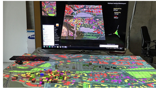
Figure 3: FindingPlaces (FP) table and game set up

The final set of the platform included: image processing of live video data to interpret the users' interaction with the tangible table, translation of those iterations into a geospatial context (GIS), and communication and visualization of the effects of the interactions. The physical elements of the system consist of colored LEGO bricks so that users can play and allocate them on a transparent table surface. To empower and push the citizen to feel an active part of the game, detailed information about the parcels of Hamburg had to be available. The already know geospatial data were clustered together to create an initial assessment of places, sorted into three ranked classes: a high indication of unsuitability; a medium indication of unsuitability; low or no indication of unsuitability.