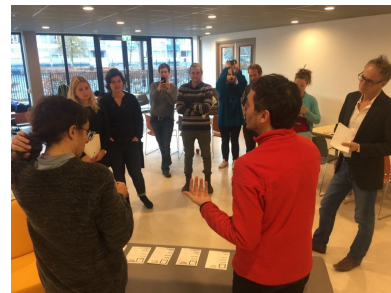
Figure 4: Utrecht: Inclusive City Game Jam (2016). Deployment phase

Each of the final games relies on skills and need passports, which ultimately grounds the game into the players’ experiences, and served as a final product for the game jam. PtC, to maintain depth and quality in conversations, proposed an environment where a maximum of 40 participants can join a session. The team and the municipality to establish some continuity between past and current stakeholders engaged, and in the relationships and partnerships constructed future welcomed sessions.