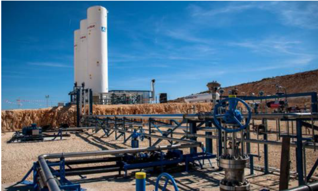
Figure 2: The Hontomin Pilot site: injection infrastructure and CO 2 tanks