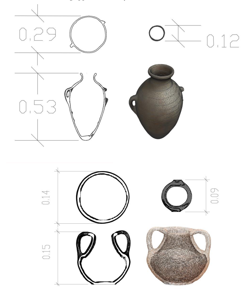
Figure 2. An example of two vases with different dimensions modelled with the Structure Sensor. The most important archaeological quantities are measured (the measurements are expressed in m).

the Scanner app of Occipital tends to smoothen the texture details so that the texture details of model are lost.