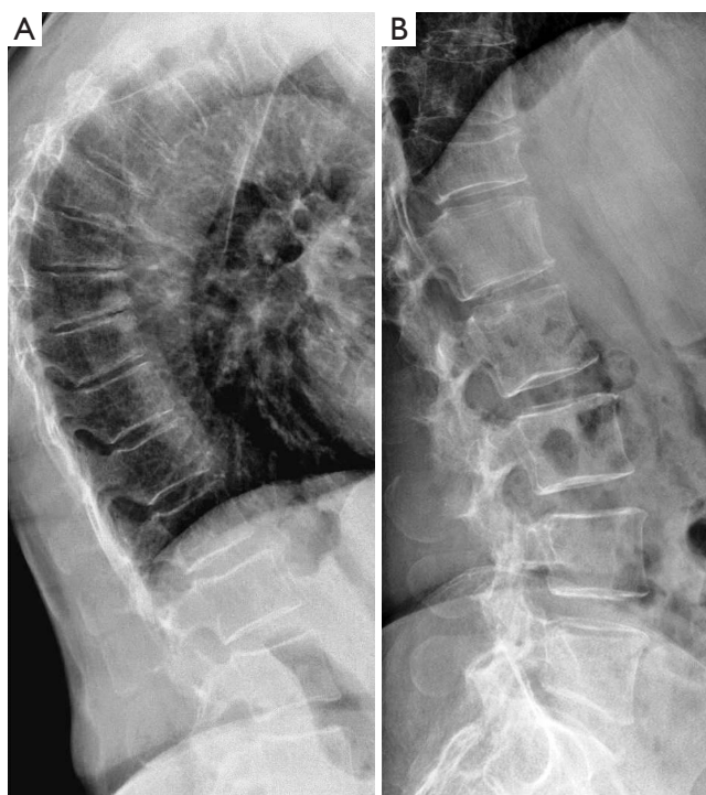
Figure 1 Radiographs shows VDs anterior wedged-shaped. (A) Moderate VDs (SQ2) anterior wedged-shaped at vertebrae T6, T7 and T8 with central endplate integrity and anterior osteophytes: wedging in osteoarthritis; (B) moderate VDs (SQ2) anterior wedged-shaped at vertebrae T12 with central endplate collapse: VF, vertebral deformity; VF, vertebral fracture; SQ, semiquantitative.

so the spine bends forward, resulting in spinal deformity (kyphosis) and height loss. An anatomic study on aged cadaveric thoracic and lumbar dissected vertebrae (T1–L5), demonstrated that the vertebral bodies are anteriorly wedged from T1 through L2 (peak at T7), non-wedged at L3, and posteriorly wedged at L4–L5 (peak at L5) (39). In other studies, the vertebral Ha/Hp ratios measured by DXA technique are resulted in women aged 70–82 years as mean of 0.90 \pm 0.04 at thoracic level with lower A/P value at T6 as 0.83 \pm 0.05 (40).