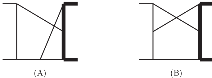
Figure 1. Seven-denominator topologies. Thin lines represent massless external particles and internal propagators, while thick lines represent massive external particles and internal propagators.