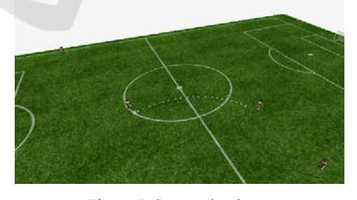
Figure 5: Soccer simulator.

An example of DEV physics games is shown in Fig. 5, where a 3D physics soccer simulator asks the student to solve the problem of passing the ball to a team-mate.