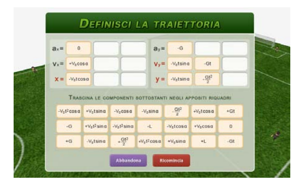
Figure 6: Soccer simulator. Construction of the motion equation, through a puzzle game.