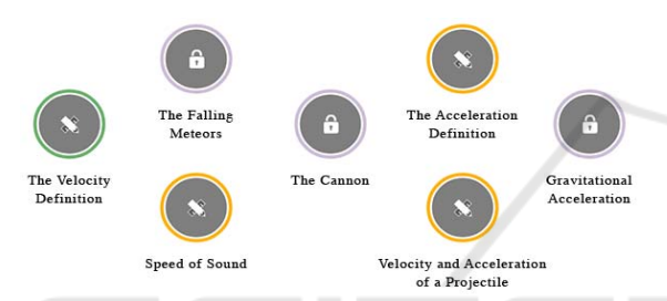
Figure 3: State after completion of the first game. Now SM = \{ \langle Vectors, 0.6 \rangle, \langle Velocity, 0.6 \rangle \} and the experiences "The Acceleration Definition" and "Speed of Sound" became accessible.

Let's assume that the learner undertakes this first experience, successfully; now Fig. 3 shows the outcome: the experience becomes "played" in the interface, and new experiences are unlocked (become accessible ).