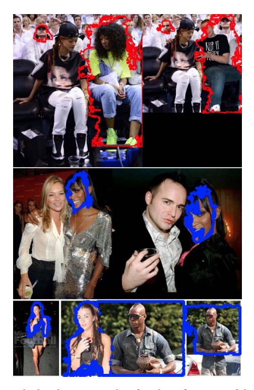
FIGURE 3: The localization results after the refinement of the binary map. The near-duplicate is on the left and the test image is on the right. In the last row, the test image is in the center with respect to the retrieved two near-duplicates.