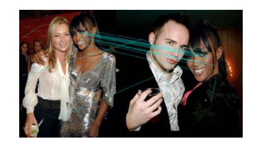
FIGURE 1: An intermediate result of the procedure: the matched SIFT keypoints between cloned regions.

In the following we review the core algorithm of the proposed method based on [7]. Such a method is subdivided into two steps in which the first one is devoted to SIFT feature extraction and to the keypoint matching, while the second one is in charge of performing clustering and localization of