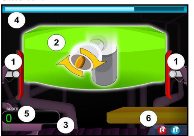
Figure1d- the interactive scenarios of Stack Attack.