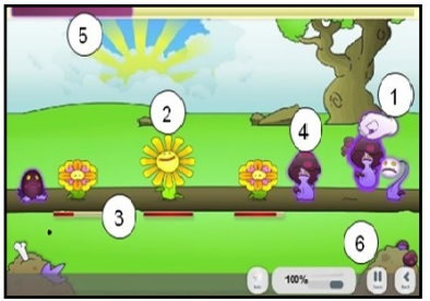
Figure1c The interactive scenarios of Wedoo