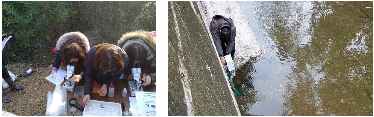
Figure 3: Students sampling, during a teaching intervention in a Greek lake.

in which teachers' associations will be given the required number of teaching hours to implement the teaching intervention. Nevertheless, it is non-probability sampling.