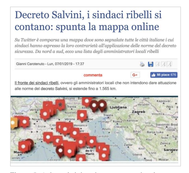
Figure 5. Acknowledging the map on national press.

The map also became a tool to recall the resistance beyond its concrete presentation: in the webpages of Internazionale , the map lives in the form of a mere link (Figure 6).