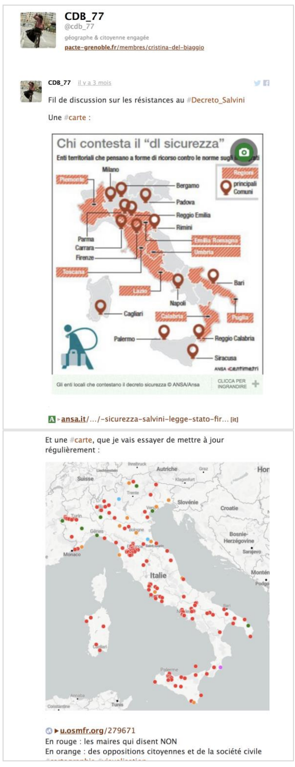
Figure 2. Posting the map.