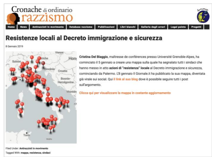
Figure 7. Symbolising the map.

Beyond its proper visualisation, the map has come to symbolise an anti-racist standpoint (Figure 7). Living in the Web through different forms of mediation, the map began not only to attract comments but it came also to activate relations and "inter-actions" (Figure 8).