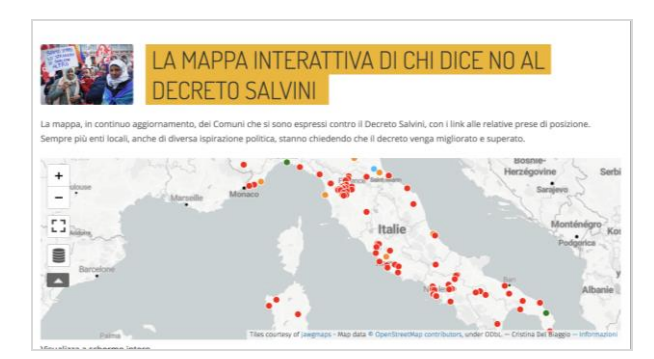
Figure 8. Stimulating inter-actions through the map.

Facebook comments relaunched the map, which came to function as a sort of imaginative projection for people opposing the antimmigration decree. In other words, as in the comment reported below, the map showed something of an invitational quality as if it were able to stimulate further protests: the map was inviting local actors to take part in it (Figure 9). The cartographic visualisation of those data was provoking emotions (Kennedy and Hill, 2017) (Figure 10).