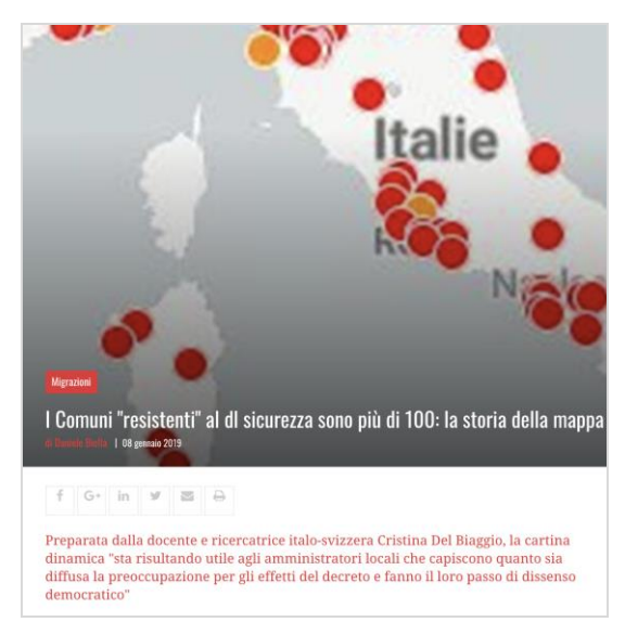
Figure 3. Telling the story of the map.

Local resistance to Salvini's legislative decree, 100 and counting. In a few days more than one hundred Italian Municipalities advanced clear actions against the application of the legislative decree on immigration and security which was enacted by the Italian Government in the Fall of 2018 and is raising serious concerns for its impact on the rights of migrant people. From Palermo to Florence, just to mention the municipalities of the major cities, to small villages all along the Boot, "every municipality is acting by itself but feels stronger because it is not alone", Cristina Del Biaggio explains. She is an Italian-Swiss university researcher and professor working at the Institute of Urbanism and Alpine Geography of the University of Grenoble. Last Saturday, she made a dynamic map of the municipalities opposing resistance to the decree primarily advocated by the Minister Matteo Salvini. A map which, as the hours pass, became filled with red points and now makes visible the growing dissent of Italian mayors of different political colours.