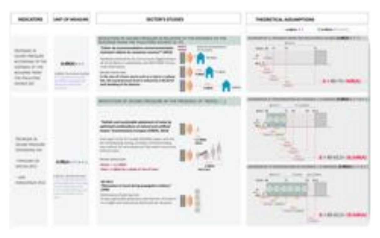
Figure 5. Theoretical scheme of the procedure adopted for the determination of the sound pressure reduction due to the insertion of tree elements and the building layout on the area of intervention.

On the basis of these data found at European-level, in the case of the area under study, the sound pressure abatement rate ( \Delta dB) is estimated numerically between the point where the noise level is measured and the building. This is based both on the physical distance between the pollutant source and the building, and on the inclusion of appropriate tree species useful for improving the acoustic quality of the air (Figure 5).