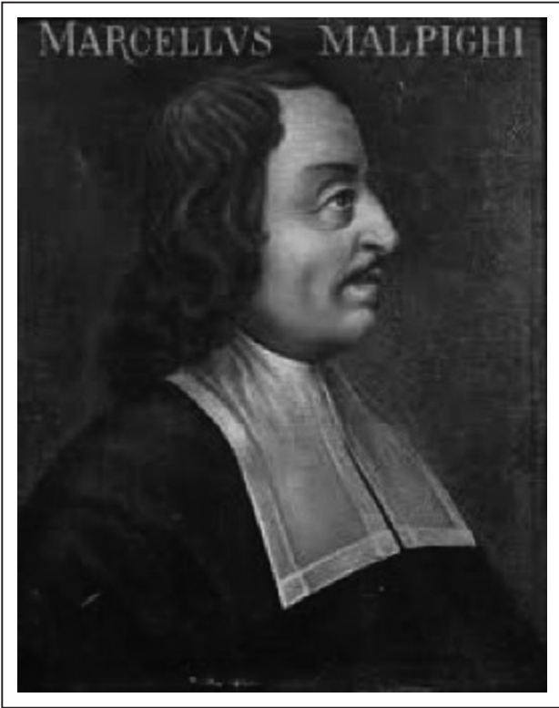
Figure 1. Portrait of Marcello Malpighi in the office of the Rector of the University of Bologna. Marcello Malpighi has represented a continuous example for the students and teachers of the University of Bologna. He has been considered a friendly mentor and tutor (oil on canvas, author not known).

essays, describing in detail the gross and microscopic characteristics of the brain, of all sensory organs, of the liver, and kidney. The reaction by the other faculty members in Messina was even worse than in Bologna.