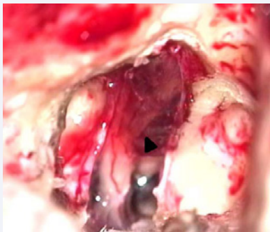
Figure 2 Translabrynthine approach, reddish soft-mass highly vascularized arised from the meatal segment of facial nerve (arrowhead).

Such lesion was well described in the literature since 1976 when Sundaresan et al. [14] reported the first two cases of cavernous hemangiomas involving the IAC. Since that time, few reports in the literature documented and confirmed the occurrence of internal auditory canal cavernous angiomas [1,2,6-