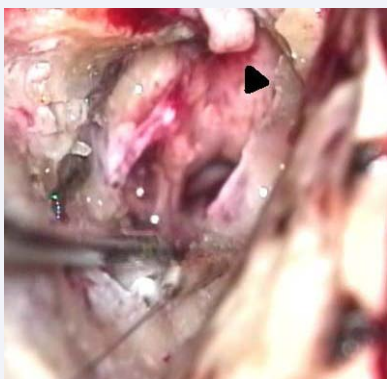
Figure 3 Auricular nerve graft to the distal portion of the facial nerve (arrowhead).