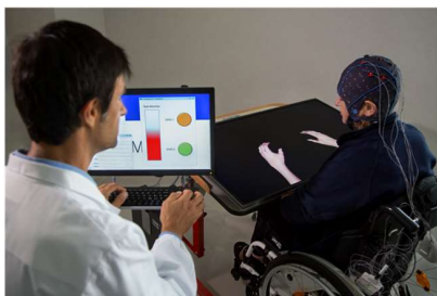
Figure 1: Training session with the Promotær. The patient is seated on a wheelchair with arms resting on a pillow. A visual representation of the forearms and hands is given on a dedicated screen, resembling the patient's own hands. The patient is asked to perform MI of affected hand and the therapist is provided with continuous feedback of the patient's EEG and EMG activity (recorded from forearm muscles).

Training sessions are carried out with the assistance of the same therapist in charge of the standard treatment for each patient, thus encouraging a further integration of our approach within the specific rehabilitation program of each patient. Before and after training, patients undergo a neurophysiological assessment in a similar way as described in [4] but with reduced number of EEG electrodes (31 positions vs 61). The aim of the screening is twofold: a) to extract EEG features for BCI training b) to evaluate the expected reinforcement of MI induced brain activation in the affected hemisphere (pre – post training). During the neurophysiological assessment, 30 trials of MI of affected hand are performed, randomized with 30 trials of rest of equal duration. BCI training is conducted with 8 electrode positions (vs 31), personalized according to the initial screening session: control features are selected among electrodes placed above the affected sensorimotor area (4 electrodes) and the montage is completed with the 4 homologous electrodes on the contralateral hemiscalp.