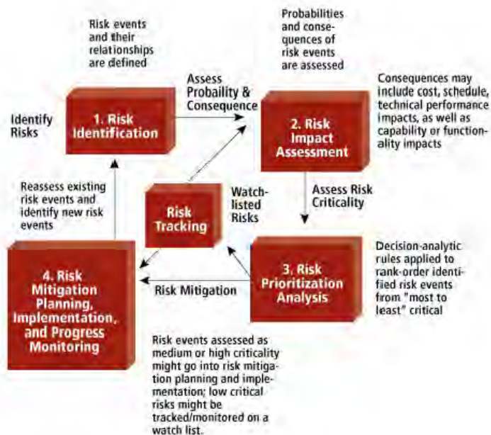
Figure 2 Risk Management fundamental steps (from MITRE's Systems Engineering Guide)

work. Social conditions, typical methodologies, cultural factors, organizational structure, and environmental features determines condition every different. Moreover, this analysis includes working activity, because these activities are the environment where risk is present and, if not opportunely mitigate, grows. In the overall process, this is the phase that has the most important number of random likelihood.