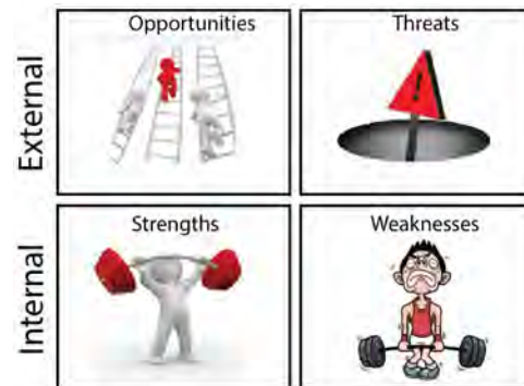
Figure 3 SWOT analysis Matrix: an easy template

But risk is not intended only as a bad condition: in the risk science, the risk is neutral in its nature and it is subjective. When an event happens, it may be understood as positive or negative, based on the risk owner and risk recipient perspectives (Tomek and Matejka, 2014). Effectively there's another methodology to approach risk that considers every condition, known as the SWOT (Strength, Weakness, Opportunity and Treat) analysis. This method is composed by a Matrix that, in every condition of risk, declines different points of view: for example, in a construction site, a hole on a floor could be at same time a threat for the likelihood to fall into it; but also an opportunity to use this opening like a passage for tall beams from a floor to others. In structural means, this hole could be a point to completely analyse the composition of structural element, but also a point of weakness for the structural behaviour of the same floor. In this methodology, the context is formalised in "internal factors" and "external factors", as described in (fig. 03). This confirm that risk management is an iterative process.