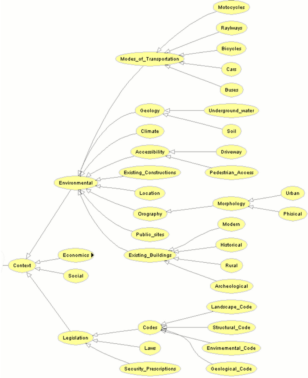
Figure 2 Context Knowledge Taxonomy