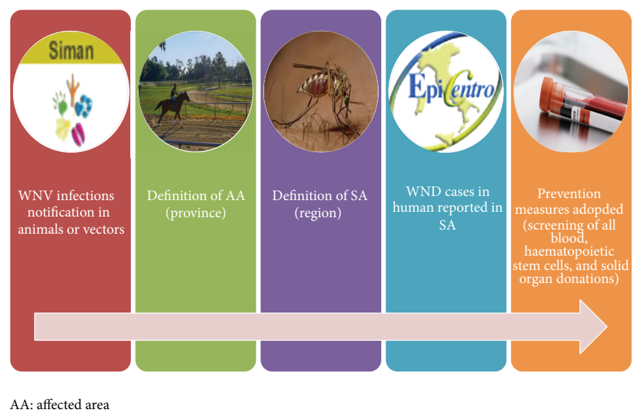
SA: surveillance area