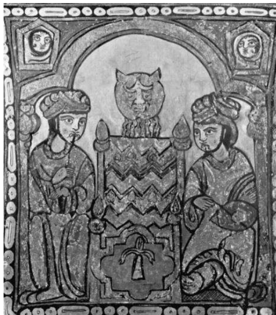
Fig. 7 - Palermo, The Cappella Palatina , panel of the wooden ceiling depicting two musicians in front of a fountain (ca. 1143; after Brenk 2010, Atlante / Atlas , II, fig. 832).