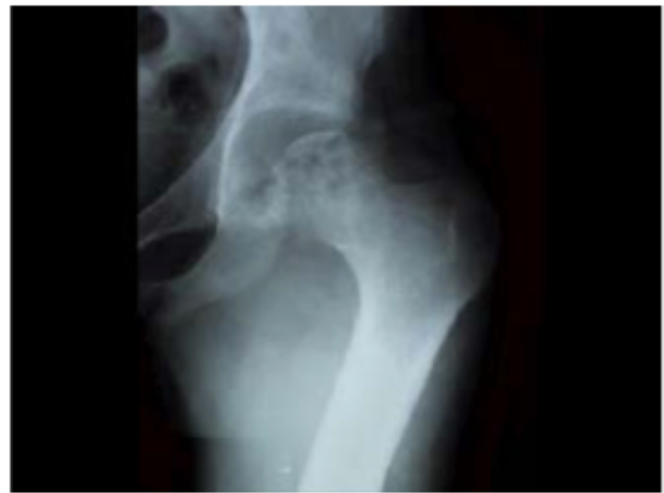
Fig. 1. Hip X-ray at the moment of diagnosis, showing lesser bone mineralization, opening of the joint surfaces and bone turnover areas on proximal femoral epiphysis.

At 3 months, the clinical picture showed improvement with negative blood serum tests and diagnostic imaging.