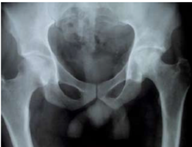
Fig. 4. Hip X-ray 1 year after treatment shows the femoral head necrosis due to the septic arthritis.