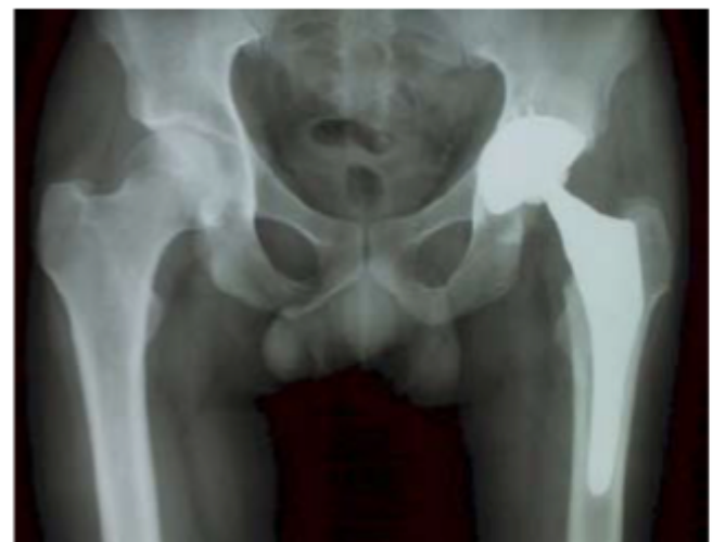
Fig. 6. Hip X-ray in anterior-posterior projection, showing the excellent result on follow up at 14 years.

signs of calcification, areas of peri-implant bone resorption, osteolysis or loosening (Fig. 6, Fig. 7, Fig. 8). There was a persisting lower limb quadriceps circumference of 2.5 cm shorter when compared to the left lower limb. He has been working regularly for the past 9 years and has recovered from the addiction, and is continuing to take medication for the Hepatitis C virus. At his last check-up, in the absence of symptoms and radiographic peculiarities, a squeaking (or creaking) sound was perceived, caused by some friction between the ceramic components of the prosthesis, audible in the movements of flexion-extension of the hip (27). The patient described such noise, which began a few months prior, as an unpleasant subjective sensation that made him apprehensive, leading him to immediately stop or slow down any physical activity. For this reason, he remains under close clinical and radiographic control every six months.