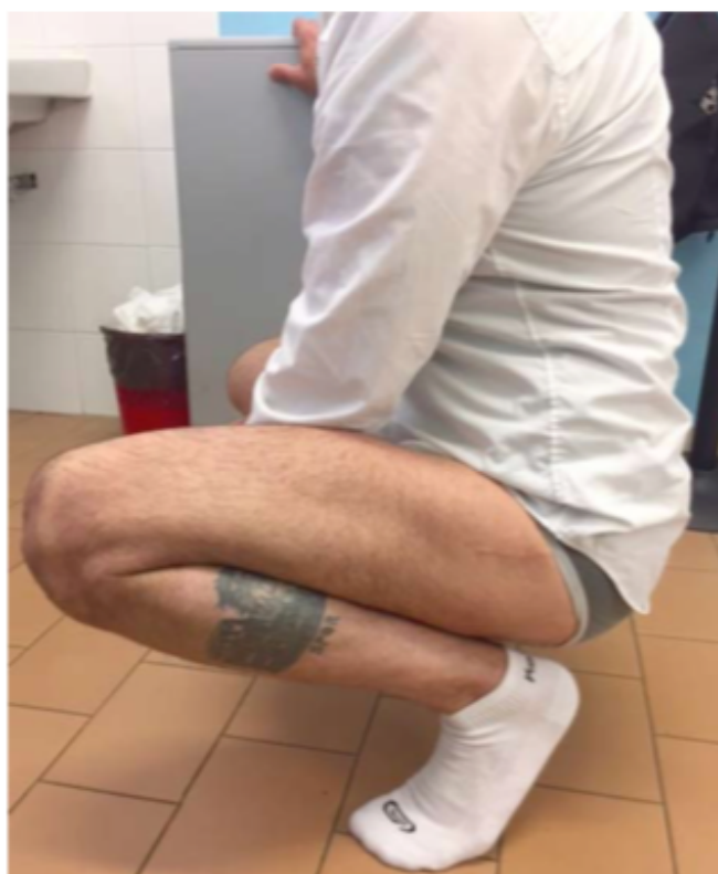
Fig. 8. Clinical evaluation 14 years after treatment shows that the patient is able to squat completely, without any pain or limitation to hip ROM.