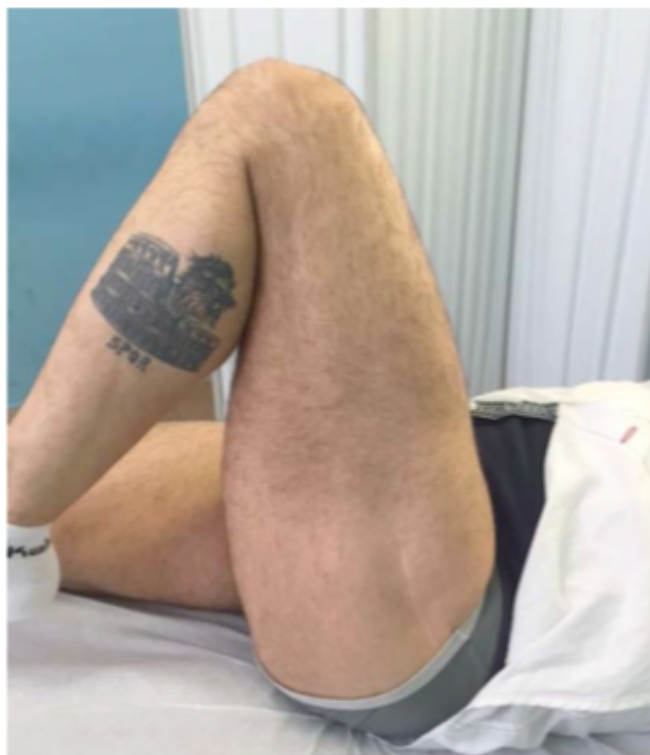
Fig. 7. Clinical evaluation 14 years after treatment shows the complete hip ROM recovery.