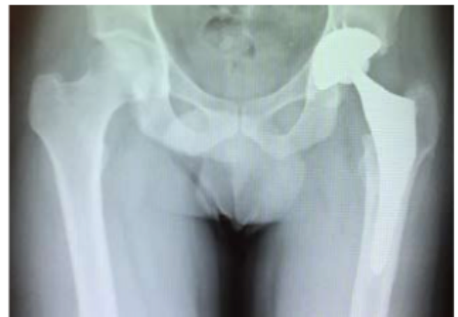
Fig. 5. Hip X-ray in anterior-posterior projection, after total hip arthroplasty surgical treatment.

signs of calcification, areas of peri-implant bone resorption, osteolysis or loosening (Fig. 6, Fig. 7, Fig. 8). There was a persisting lower limb quadriceps circumference of 2.5 cm shorter when compared to the left lower limb. He has been working regularly for the past 9 years and has recovered from the addiction, and is continuing to take medication for the Hepatitis C virus. At his last check-up, in the absence of symptoms and radiographic peculiarities, a squeaking (or creaking) sound was perceived, caused by some friction between the ceramic components of the prosthesis, audible in the movements of flexion-extension of the hip (27). The patient described such noise, which began a few months prior, as an unpleasant subjective sensation that made him apprehensive, leading him to immediately stop or slow down any physical activity. For this reason, he remains under close clinical and radiographic control every six months.