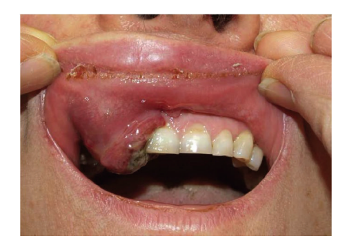
FIGURE 1: Preoperative intraoral view of the lesion.