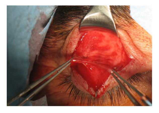
Figure 4 Aponeurosis of the levator muscle.

There are two possible approaches described. The anterior approach consists of exposure of the levator aponeurosis using a superior eyelid crease incision and the advancement of the levator aponeurosis by folding or excising the muscle. The aponeurosis is reattached to the anterior surface of the tarsus with nonabsorbable sutures. The transconjunctival approach or the small skin incision (8–13 mm) represents an alternative to the anterior procedure, leading to a reduced distortion of the tissue and a better cosmetic result. The main disadvantage of the small incision approach is otherwise the limited view of the surgical field. The benefits obtained by this type of surgery are the preservation of the anatomical planes and the elevating structures of the eyelids, including