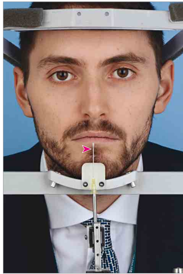
Figure 1. Headrest Apparatus Designed to Reduce Head Movements

The midline position of the participant's face is aligned with a pointer (arrowhead).