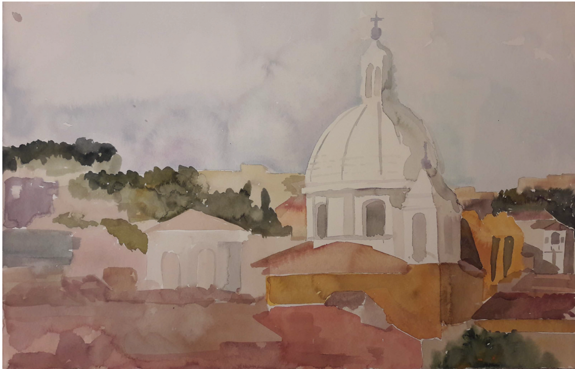
Fig. 6 A skyline of the centre of Rome with the dome of San Rocco Church. Watercolour drawing.

with other graphic techniques. When executing a real-life drawing, the very first visual impact captures the intensity of the light and colour; only afterwards does one appreciate the form, bulk and shape of the structure in question. The graphic process elaborates visual notes, sketches and studio drawings, which gradually help to define volumes, spaces and geometries. It is very important to be both sensitive and critical in order to appreciate the more immaterial, intangible features that characterise a place and make it recognisable.