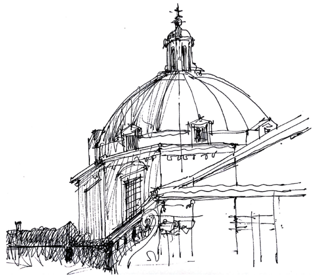
Fig. 4 A study of the geometrical form and proportion of a church dome. Pen and ink drawing.

((cit. A. Bonito Oliva in Si fa presto a dire colore))