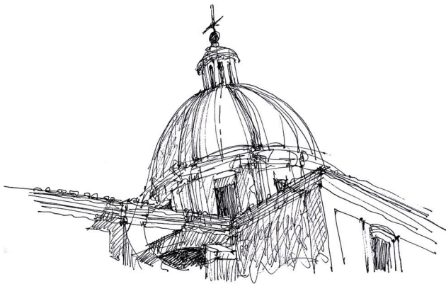
Fig. 3 A close view of the dome of San Rocco Church looking upwards from the ground. Pen and ink drawing.