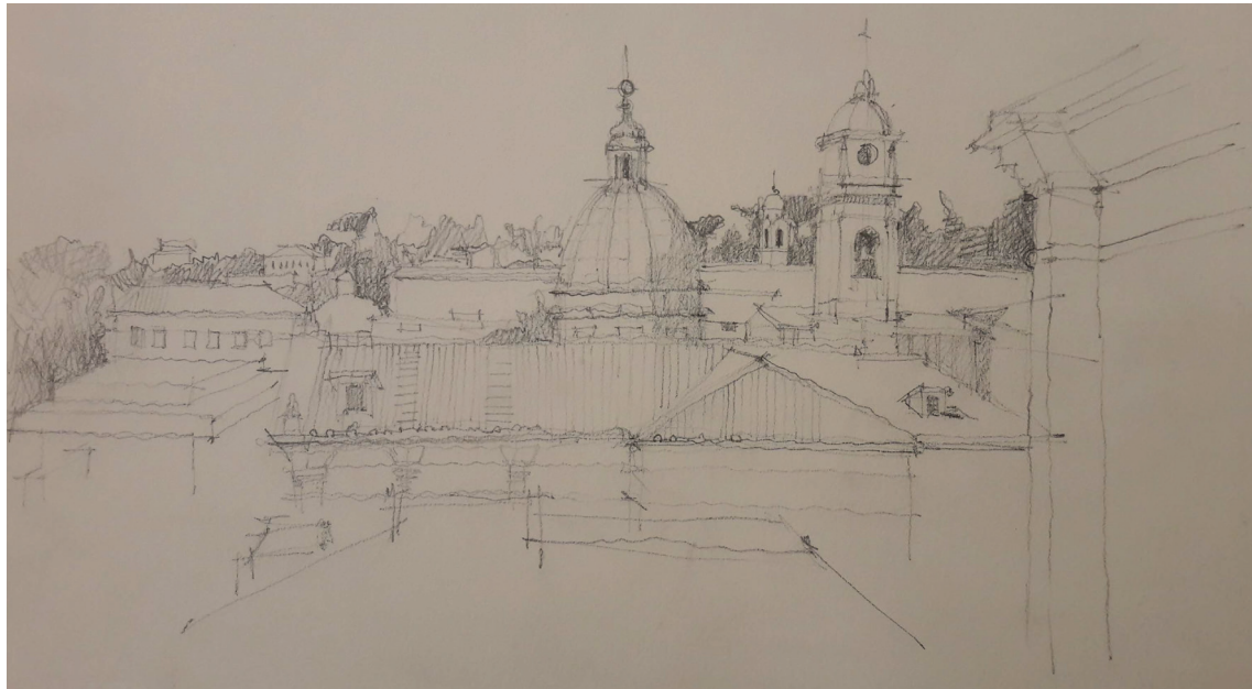
Fig. 1 Roman skyline with the dome of San Rocco Church in the middle. Pencil drawing.

with the top part of the sheet of paper. As a result, in our research, the focus was more on what is called, in the graphical analysis process performed during drawing, the study of how a building is “ fixed to the ground ” (cit.).