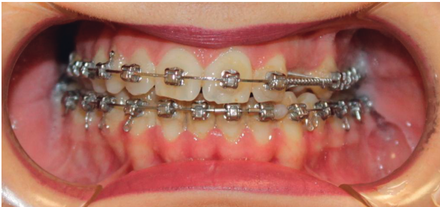
FIGURE 3: Patient occlusion 1 year after surgery.

As refinements, genioplasty and lipofilling procedure was performed.