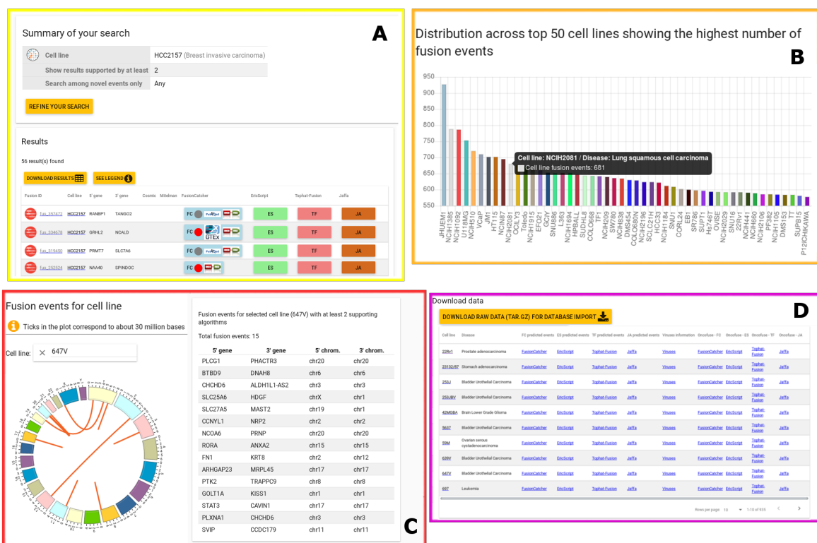
Figure 2. An overview of LiGeA portal. a) A 'Search by Cell line' example and the corresponding output; b) An overview of the input dataset; c) A circos diagram showing the graphical outcome of a 'Query by cell line' and the corresponding related table; d) An extract from the 'Download' web page.