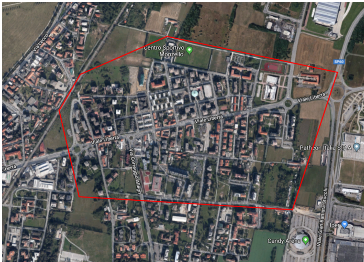
Figure 1: NLEZ pilot area boundaries (Libertà district).