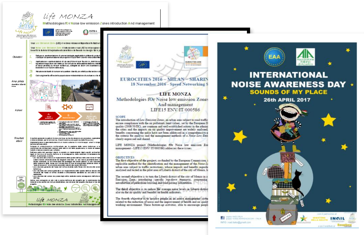
Figure 7: Documents presented during some dissemination events.

The parameters illustrated in Table 1 have been selected and agreed among Project partners to be introduced in the GI.