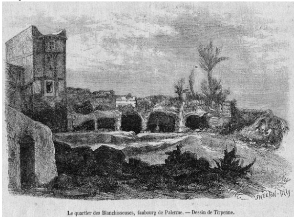
Fig.1: An engraving published by the French Journal “Le Magasin Pittoresque” in 1874. It illustrates a building in Palermo located in the unknown “Laundrywomen district”. Note the extraordinary similarity to an ancient theatre.