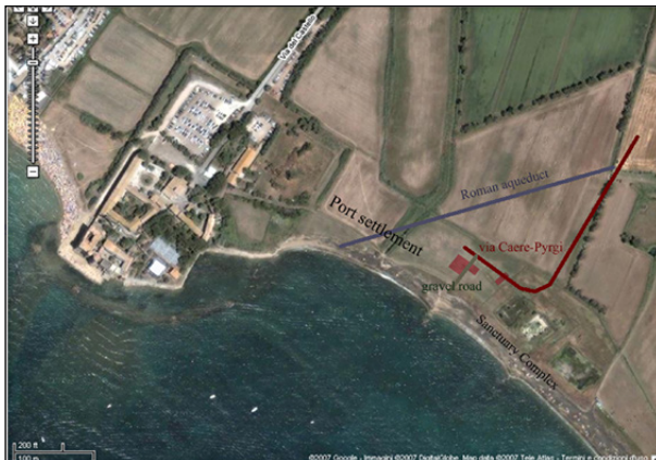
Fig. 1 – Aerial photo of the coast of Pyrgi: the harbour’s underwater structures, the settlement, the Caere-Pyrgi road and the sacred district.