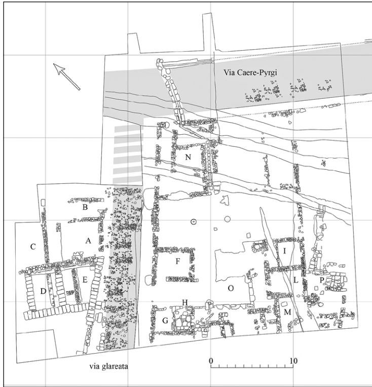
Fig. 4 – Plan of the new excavation area.

areas have provided evidence of decorated buildings at an early stage (around 530 BC). The new excavation area (Fig. 4) is providing on the other hand precious information about the layout of the settlement since the moment of its foundation (late 7 th century BC).