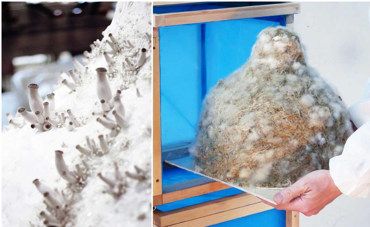
Figure 16. Jonas Edvard, MYX Mushroom textile Project, plant fibre and mushroom-mycelium.

The MYX lamp by Jonas Edvard, consists of plant fibre and mushroom-mycelium. The lamps are grown into their shape over a 3-week period during which the mushroom eats and grows along with the plant fibres into a flexible and soft living textile. After the edible mushrooms are harvested, the waste can be used as a dry and lightweight material that is organic, compostable and sustainable.