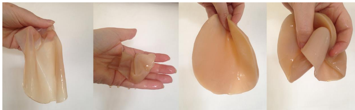
Fig.7. Cecilia Cecchini, eco-leather made with the fermentation of bacteria.

Moreover, combining PHAs with different monomers allows bioplastics with very different properties to be obtained: thermoplastic or elastomeric materials, with melting points ranging from 40 to over 180°C.