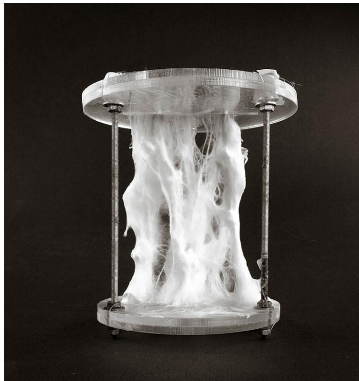
Figure 17. Gianluca Tabellini, "Mycelium Tectonis", research about mycelia and architecture.