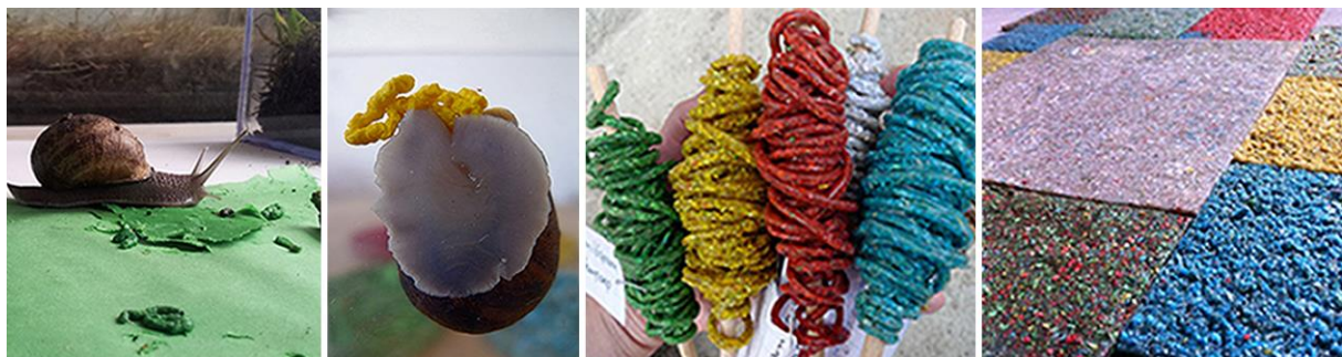
Figure 13 . Lieske Schreuder, threads and titles made of snail excrement.

Perhaps the most bizarre experiment is the one by Dutch designer Lieske Schreuder, which causes snails to produce colourful excrement that may be likened to biopolymers, thanks to the coloured paper she feeds them. The snails’ faeces can be pressed into a mould using a spatula to create a delicate thread with a five-millimetre diameter, with which she crafts a sort of multi-hued woven fabric.