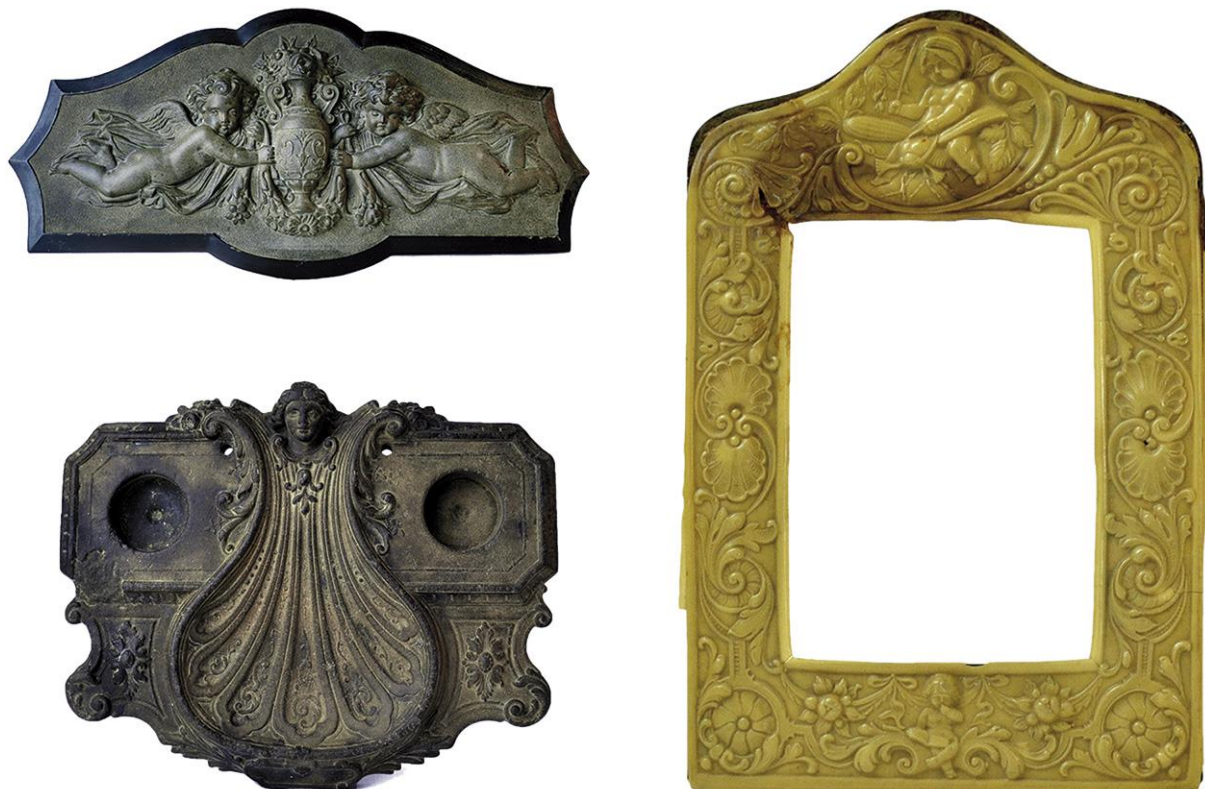
Figure 1. Title with bas relief, bois durci, an animal-based polymer obtained by mixing cow blood with sawdust. Figure 2. Ink bottle, bois durci. Figure 3. Frame, cellulose nitrate a raw material used to make Celluloid (Plart Foundation, Italy).

Indeed, the synthetic plastics of our own time – which, thanks to the manipulations done on the macro, micro, and nano level, astound us with their surprising performance – spring from countless attempts made in the pre-technological age. These efforts made it possible to produce the first artificial plastics obtained through rudimentary physical and chemical processing starting from molecules present in nature in amorphous form (cellulose, starches, seeds, milk proteins...): Charles Goodyear added sulphur to natural latex to obtain Ebonite (1843); Alexander Parkes developed Parkesine (1862) by mixing together vegetable oils, naphtha, and camphor; John W. Hyatt used nitrocellulose and camphor to obtain Celluloid (1869), the first widespread artificial material.