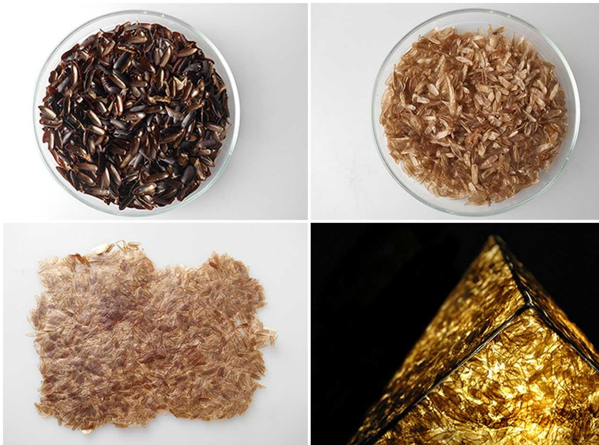
Figure 12 . Aagje Hoekstra, “Coleoptera,” made of pressed insect shells.

same polymer, bonds better due to the variation in its molecular composition. She then presses the chitosan together to make the “insect plastic” Coleoptera. Thin layers of this material are used to make small items and jewellery.