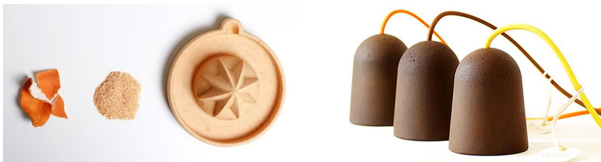
Figure 4. Alkesh Parmar, orange juicer made from orange peel. Figure 5. Raul Lauri, pendant light made of "Decafé" a material made from used coffee grounds.

Bioplastics certainly have a lighter environmental load than synthetic ones, but the base material they are made of is of no small importance as regards both the environment and ethical concerns. Today, the material most used for their production is corn; although the quantities at stake pale in comparison with the global production of this cereal, this still raises an important question: is it right to use for other purposes a crop that can be eaten, that provides basic sustenance for a part of the world's population? It is the same question posed for biofuels. Corn prices are soaring; given the repercussions on the world food system, and the hoarding of immense landholdings by rich nations in the poorest countries in order to plant crops for these purposes, the question is not only a legitimate one, but is one that must be asked.