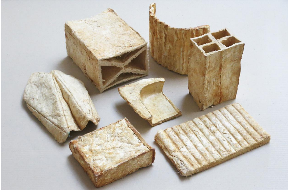
Figure 6. Jonas Edvard, MYX Mushroom Project.