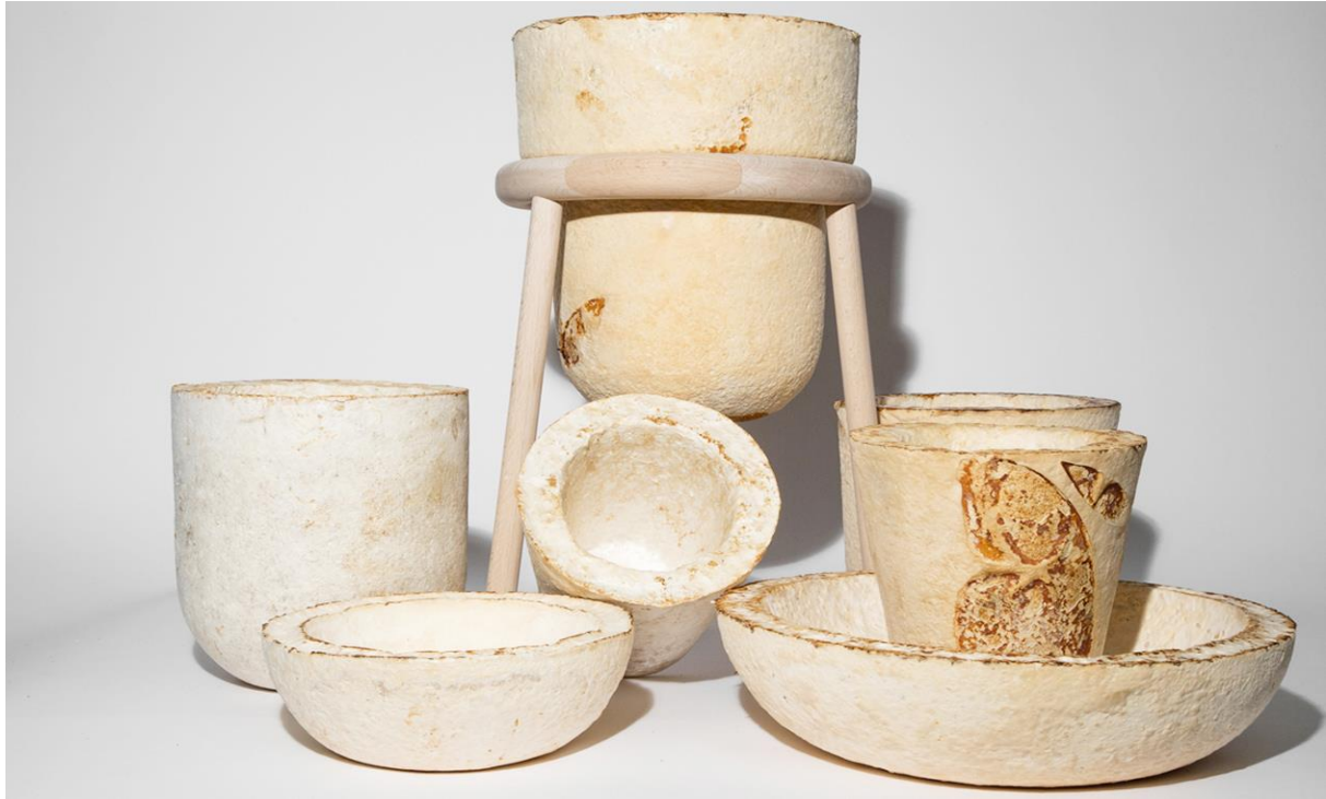
Figure 15. Maurizio Montalti, "Mielium Material" composite organic material cultivated using fungal mycelium.

The MYX lamp by Jonas Edvard, consists of plant fibre and mushroom-mycelium. The lamps are grown into their shape over a 3-week period during which the mushroom eats and grows along with the plant fibres into a flexible and soft living textile. After the edible mushrooms are harvested, the waste can be used as a dry and lightweight material that is organic, compostable and sustainable.