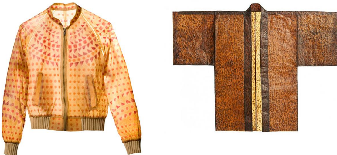
Figure 9 . Suzanne Lee, BioCouture made of a symbiotic mix of yeast and bacteria.

On the other hand, Suzanne Lee, founder of BioCouture, uses a symbiotic mix of yeast and bacteria to grow fabrics similar to vegetable leather. With it, she makes apparel and shoes. It is a material that is not only biodegradable, but is compostable as well. She believes that in the future, clothing materials themselves might be living organisms that could work symbiotically with the body to nourish it and even monitor it for signs of disease.