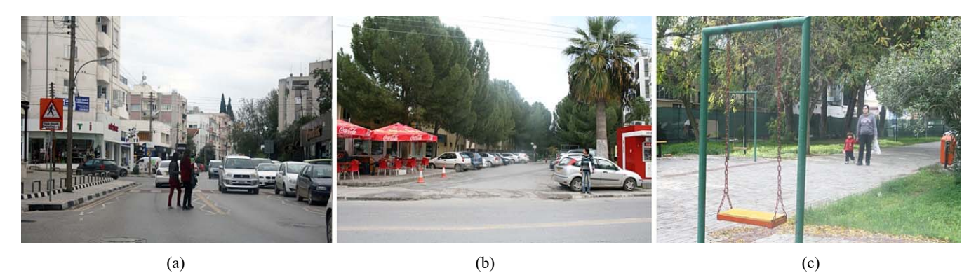
Fig. 3 (a) Pedestrian and cars in conflict (b) Entrance of park as a parking lot (c) Park as a pleasant pedestrian path, and lack of functions around it