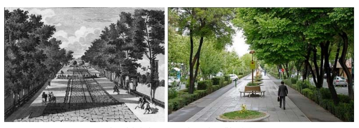
Fig. 5 Chaharbagh Street past and currently conditions [29]

As mentioned before, Chaharbagh Street is one of the historical and important streets in Isfahan. Isfahan is located in the Zagros foothills. The climate of the city is long hot-dry summer and cold-dry in winter. Chaharbagh Street, whose names come from Four Garden, has been designed based on Persian Gardens to make balance between hard climate and human thermal comfort condition. The street continues by a mild slope toward the Zayandeh Rood River. In Safavied period, there was a stream at the middle of the street. Unfortunately, later the stream was blocked and lost its positive effects on the environment (Fig. 5).