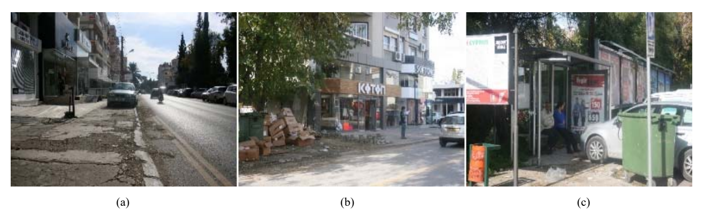
Fig. 4 (a) Pedestrian quality (b) cleanliness of the street (c) street furniture and bus stop location, cars blocked pedestrian path

The functions of street include; shops, restaurant, offices, residential, hotels and other facilities. Organization of functions is random through the street, and relationships between the residential parts and other functions are weak. The street is not serving the daily needs of the nearby residents; due to this fact, local people who can access the street by walk do not use the street efficiently. Despite this weakness, the street seems to be attractive for the public in terms of 'brand shops', 'restaurants', 'cafes', 'banks', and 'offices'. The facade of the street is covered by different types of buildings in different height levels between 1 and 6 stories. There is no unity among them in terms of facade, height, material, etc. (Fig. 3 (a))