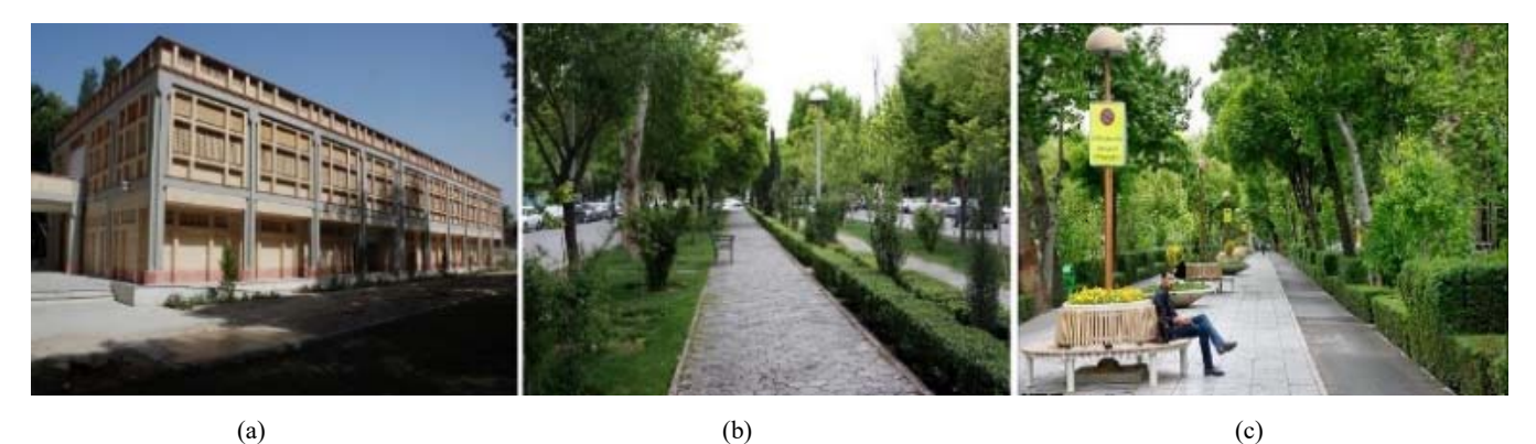
Fig. 8 (a) Renovated facade of Chaharbagh Street (b) New development section of Chaharbagh Street (Southern part) (c) Street furniture

Chahrbagh Abbasi and Chaharbagh Paeen (Lower) have a same and simple landscape design which clarified the vehicle path in parallel by pedestrian path that made a place in accordance with human thermal comfort for users. But the in pedestrian path of Chaharbagh Bala (southern part) which is more newly developed part by different building characteristics, designers made some changing in design to create different and attractive place for users (Fig. 8 (b)).