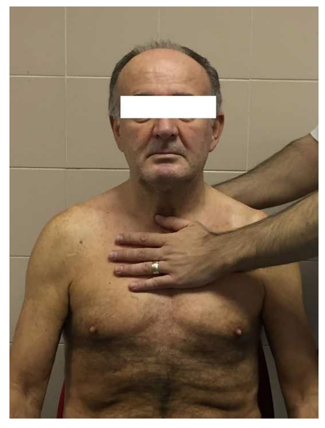
Figure 3 Second phase of osteopathic manipulative treatment.

Osteopathic sessions were carried out over 5 consecutive days, with OMT applied for a maximum of 15 minutes. The OMT included three phases involving the whole mediastinum. During the first phase, the operator stands behind the patient, resting his hands on the thoracic outlet, with his index and middle fingers on the clavicle and the thumbs up to C7, facing each other, while the ring finger and little finger stay on the anterior area of the chest. In the second phase, the operator places one hand on the anterior area of the sternum, while the other hand is parallel on the patient's back; as the last phase, the hands are placed on the anterolateral area on the costal diaphragm (Figures 2–4).