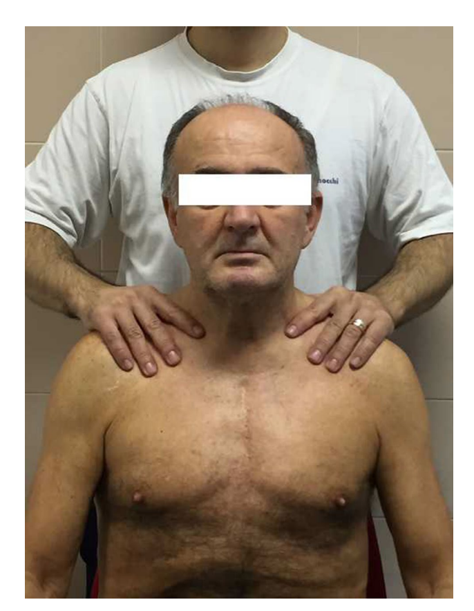
Figure 2 First phase of osteopathic manipulative treatment.