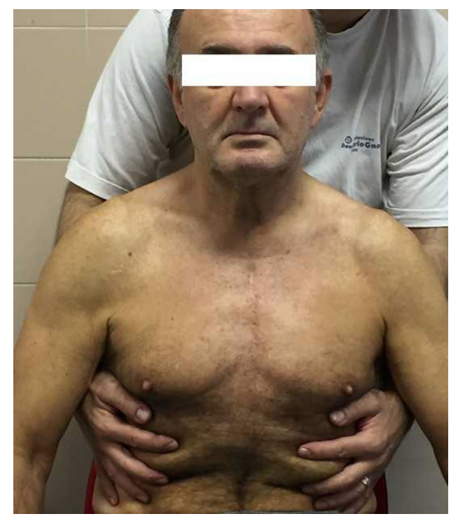
Figure 4 Third phase of osteopathic manipulative treatment.

During the day following the last OMT treatment, tests on the patient's skin surface were repeated, after a followup physical exam and findings of unchanged results by the