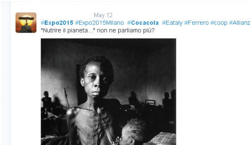
Fig. 2 – Inconsistency between Expo value proposition and sponsors 7