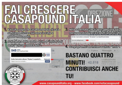
Fig. 3 – CasaPound Poster: Fundraising Campaign