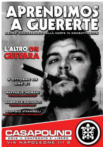
Fig. 1 – CasaPound Poster: Ernesto 'Che' Guevara

and societal and political forms. Figuring out how much and in what way this form of right-wing political extremism will conform to the general characteristics of the network society (Castells, 1996) is therefore the main focus of this paper.