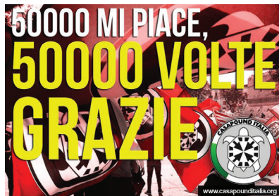
Fig. 4 – CasaPound Poster: Acknowledge for Facebook Likes

prevents the viewing of the video, nor hinders the political message it conveys. The juxtaposition, this term seems fitting, of the banner on the video of CasaPound, however, shows a clear complex entanglement between political phenomena, political categories, and media processes, especially if one takes into account the good fortune and the meaning that the concept of extremism has enjoyed and continues to enjoy in global scenarios. Is it therefore still possible to evoke the concept of extremism when describing political phenomena of this kind? That's hard to say. Certainly, the Internet's modes of communication, and in particular those of social networks which shape the language of extremism, produce major changes between the latter and the rest of society. This does not mean that the subversive potential and anti-democratic policies of these formations has failed. It simply must be observed, especially for the purpose of a theoretical advance in media studies and the phenomena related to them, as the historical evolution of a concept (extremism) is unaffected by the changing medium through which it is expressed.