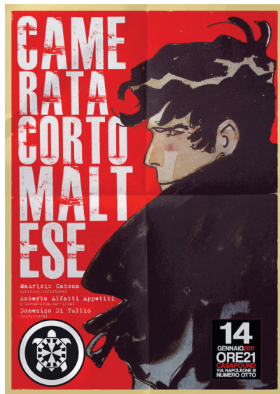
Fig. 2 – CasaPound Poster: Corto Maltese

The imagery of the media and consumption in the identity processes of political extremism