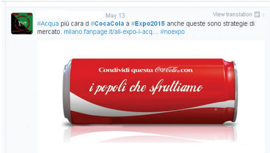
Fig. 1 – Reappropriation of a Coca-Cola can 6