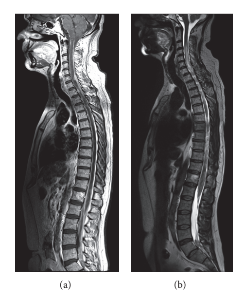
FIGURE 2: Contrast-enhanced T1- (a) and T2-weighted (b) whole spine MRI sequences showing disseminated intradural intra- and extramedullary Embryonal Tumor of the cervicothoracic tract and cauda equina.

The patient underwent a primary biopsy on the lumbosacral localization which appeared to enlarge the S1-S2 posterior sacral foramen causing compression of the right S2 nerve root. Using a posterior approach, a central L5 laminectomy along with median durotomy was performed exposing a grey, soft, hemorrhagic mass which completely enveloped the roots of the cauda equina.