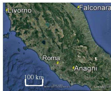
Figure 3. Company 2 geographical data.

Similar to Company 1, aggregates in Company 2 are both natural (purchased from the quarries) and recycled (from recycling plants), and 20% of the total aggregates in the binder mixes are recycled. In this case, the bitumen is obtained from two refineries located in Falconara and Livorno (Italy) and limestone is extracted from a quarry in the city of Anagni (Figure 3, obtained from Google Earth). Regarding the transportation of raw materials, bitumen and fuels are transported from the refineries to the plant by tankers with a capacity of 20 m 3 , while aggregates are transported from the quarries to the plant by trucks with a capacity of 20 m 3 . Energy sources in this plant include low-sulfur crude oil, which is used to feed the oven in the plant mix, and gasoil, which feeds the diathermic oil boiler. The annual consumption of gasoil is 107,640 kg and the annual consumption of low-sulfur crude oil is 533,073 kg. In terms of production, this plant manufactures 51,257 m 3 of asphalt concrete per year (the average hourly production is 101 m 3 ).