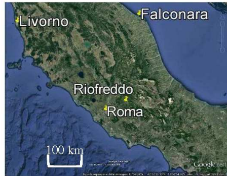
Figure 2. Company 1 geographical data.

and fuels are transported from the refineries to the plant by tankers with a capacity of 30 m 3 , and aggregates are transported from the quarry to the plant by trucks with a capacity of 20 m 3 . Regarding the energy sources used in the plant, the burner and the thermal oil boiler work with methane gas, and the annual consumption of natural gas is 730,835 m 3 , while the annual electricity consumption is 392,020 kW. Finally, the annual production of asphalt concrete in this plant is 49,758 m 3 (the average hourly production is 80 m 3 ).