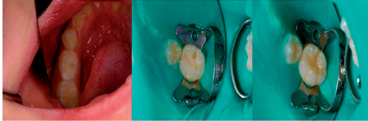
Figure 1. Case report of Group A and C.