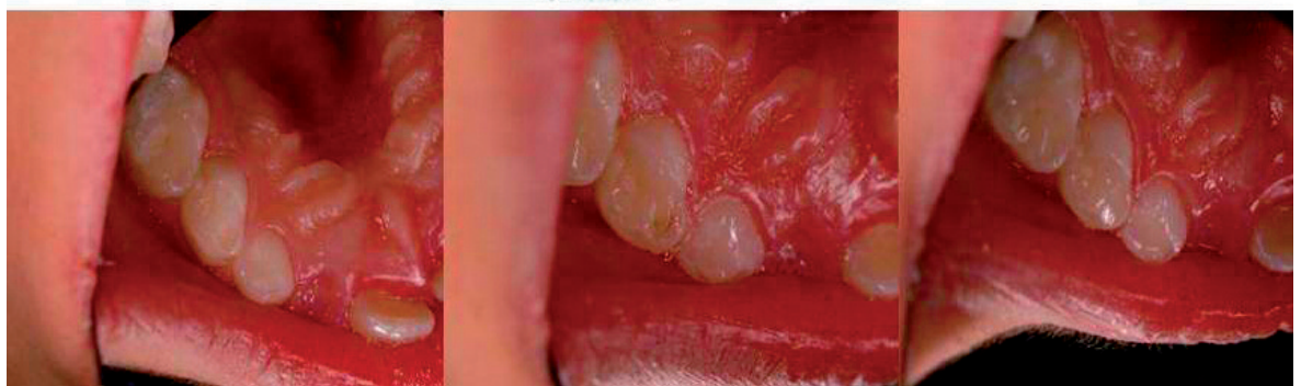
Figure 2. Case report of Group B and D.

Annali di Stomatologia 2016;VII (1-2): 24-28 Copyright © 2016 CIC Edizioni Internazionali Unauthorized reproduction of this article is prohibited.