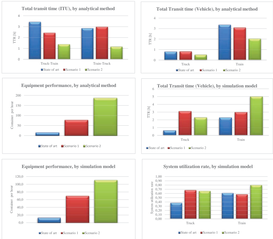
Fig. 4. Main result obtained and comparison of scenarios.

The following figures show the main results obtained for scenarios and the comparison with state of the art situation (see Fig. 4) for a subset of relevant KPI calculated for the most appropriate method/model.